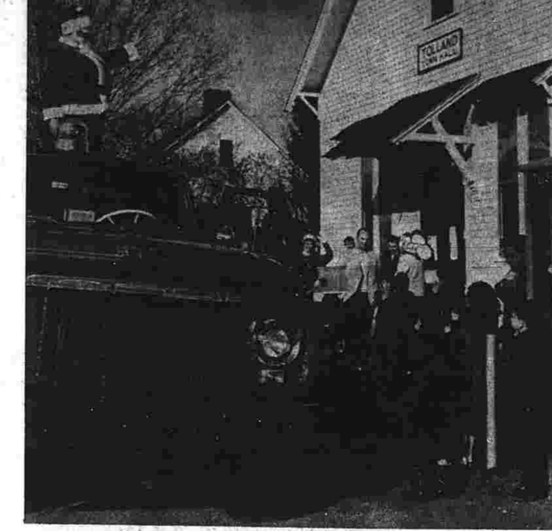
Tolland Welcomes an Early Visit from St. Nick