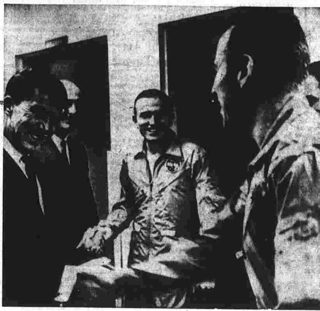
Haven't We Met Somewhere Recently? Greeting one another on solid ground after their rendezvous 185 miles straight up last Wednesday with Astronauts Wally Schirra, Tom Stafford, Frank Borman and Jim Lovell (from left). This reunion took place yesterday in crew headquarters at Cape Kennedy.