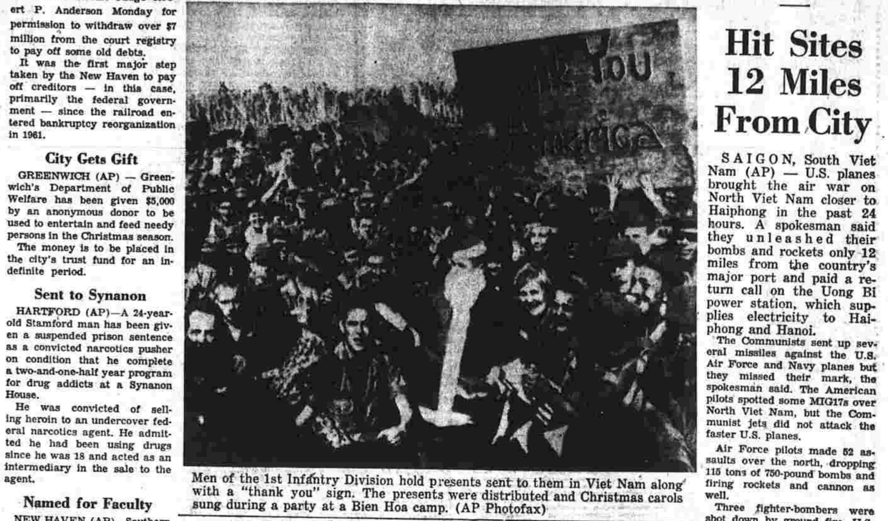
Men of the 1st Infantry Division hold presents sent to them in Viet Nam along with Communist jets which were being distributed and Christmas carols sung during a party at a Bien Hoa camp.